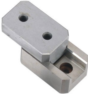
下模 nether mold